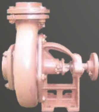
IM 3025 HH